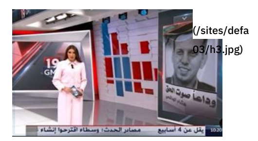
Figure 2: Al-Hadath TV reveals the March 21, 2024 exoneration by the Iraqi judiciary of Hisham al-Hashemi's

Is it to be the institutionalized forces of law and order, the Iraqi police and armed forces or the militias who shape the country's future? Only the reaction of the Iraqi government to the brutal murder of one of its own will decide what the answer will be.