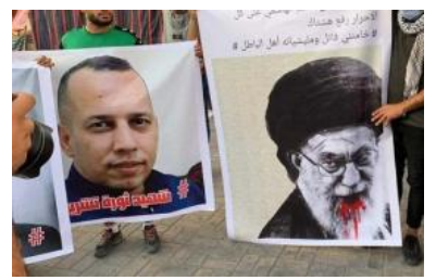
Hisham al-Hashemi's Killer Escapes Justice (/policy-analysis/hisham-al-hashemis-killer-escapes-justice)

(/policy-analysis/how-use-militia-spotlight)